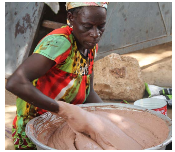
A woman producing shea butter

All published documents will be available for GSA members when the project ends in February 2020.