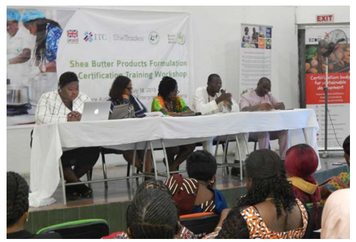
Participants at the workshop in Nigeria