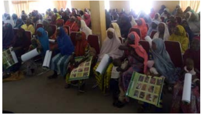
The trainings included an official opening ceremony with women shea collectors and processors

"These trainings will help us in producing better quality kernels to increase our profits this season. Also, the equipment received will improve our working conditions."